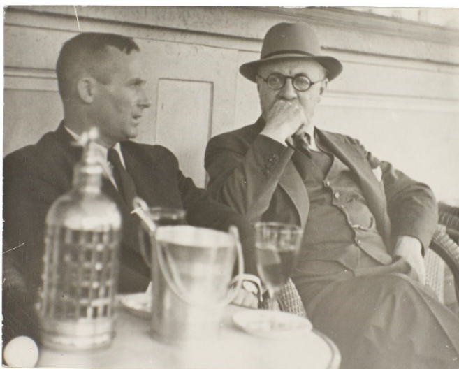
Joan Miró and Henri Matisse at the café Les Deux Magots, Paris, c. 1936.