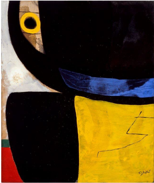
Joan Miró. Cap, ocell, 1976.