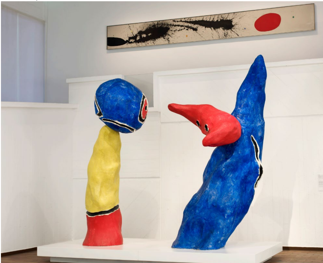
Juan Miró. Pair of Lovers Playing with Almond Blossom. Maquette for the sculptural group in La Défense, Paris, 1975. Fundació Joan Miró, Barcelona

The collection of works in the exhibition make it possible to chart the course of Miró's career in sculpture, not just from a chronological point of view, but also in terms of the development of the artist's technique through the experimental risk that he took in his creative process.