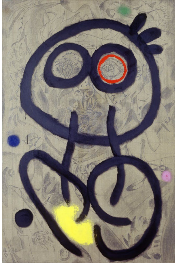
Joan Miró, Autoretrat , 1937-23 febrer 1960, oli i llapis damunt tela, 146 x 97 cm, Barcelona, Fundació Joan Miró

In a profound manner, their friendship and their visions of their respective works can be explained by the similarities in their conceptions of art, which question the autonomy of the painted or drawn image. Matisse always accorded a primary role to the notion of the 'decorative' in his aesthetics. Miró made a name for himself thanks to the idea of the 'assassination of painting'. These two visions are not contradictory. On the contrary, they are in accord because they share the same vision of overcoming representation in the traditional sense of the term. In both cases, the creative process combines a deconstructive movement with a refounding movement in order to endow the visual creation with agency. Consequently the exhibition reveals that there is violence in Matisse's decorative aesthetic, just as there is gentleness in Miró's 'assassination'.