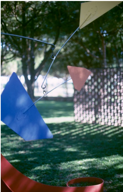
Calder at the Fondation Maeght