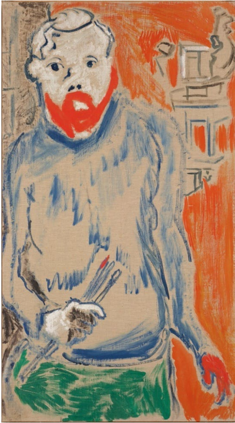
André Derain, Retrat d'Henri Matisse , 1905, oli damunt tela, 93 x 52 cm, Nice, Musée Matisse